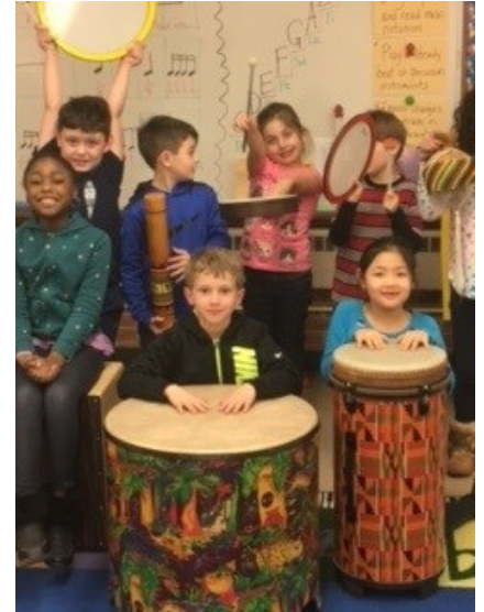
Second grade layering rhythms with percussion instruments from West Africa!